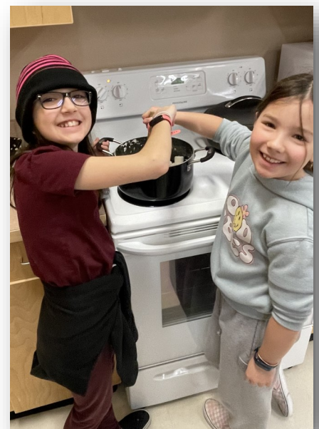
Right: Working on a special project in the Practical Life room.