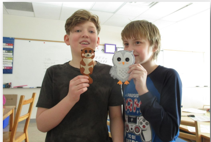
Above: Hand-stitched animal craftwork